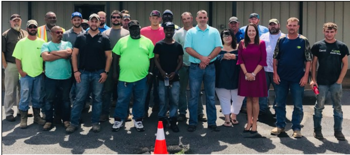
Coaching In the Moment – Leader Edition August 20, 2019 – Group 2