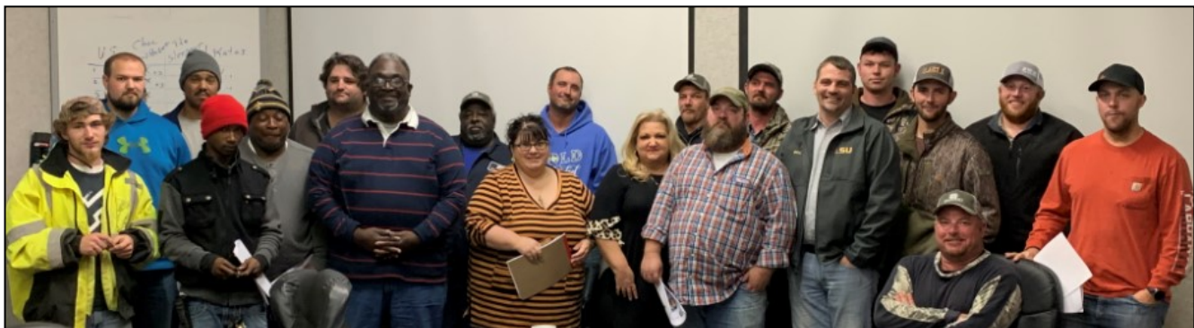
Mastering Influence: Leader Edition, Group 2