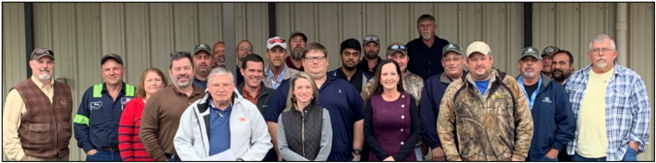
Mastering Influence: Leader Edition, Group 1

This curriculum is designed to help leaders recognize and understand different methods and styles of communication, influence, perception, and response. Participating leaders will learn how to better analyze a situation and navigate to a more effective method or style of communication. The program will align with our GCC organization vision, mission, and values and will explore the characteristics of a leader's ability to positively communicate and influence the workforce.