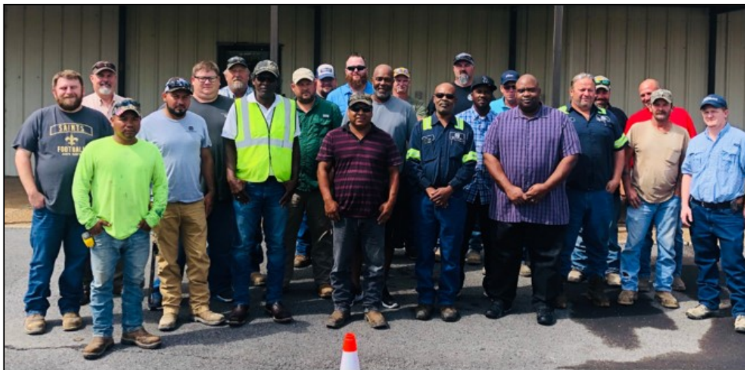
Coaching in the Moment – Leader Edition August 21, 2019 – Group 3