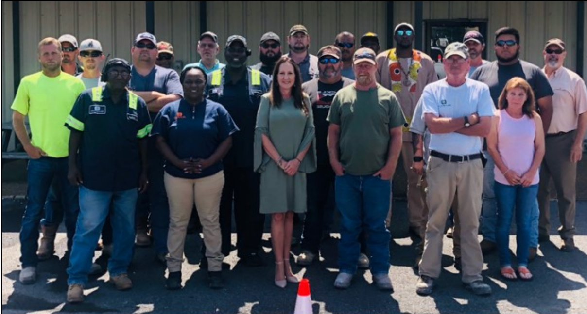
Coaching in the Moment – Leader Edition August 21, 2019 – Group 4