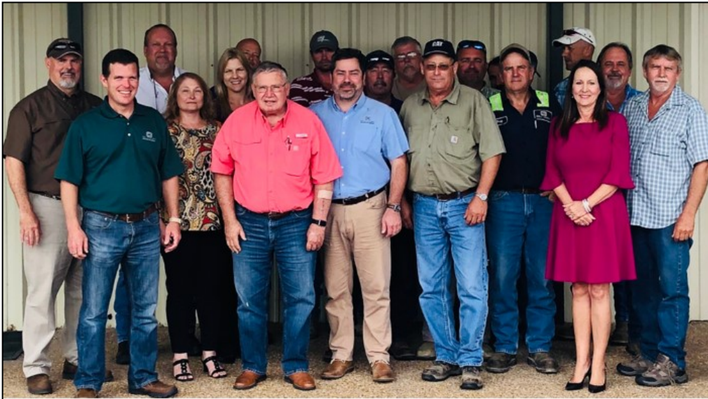
Coaching In the Moment – Leader Edition August 20, 2019 – Group 1

Participating leaders learned how to navigate coaching opportunities and utilize influence skills. The program aligns with our GCC organizational vision, mission, and values and explores the characteristics of a leader's behavior – the extent to which a leader relies on their authority and the extent to which they demonstrate a respect for people.