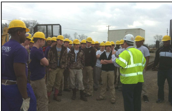
ASH students receive instruction on safety areas around cranes and raised loads.